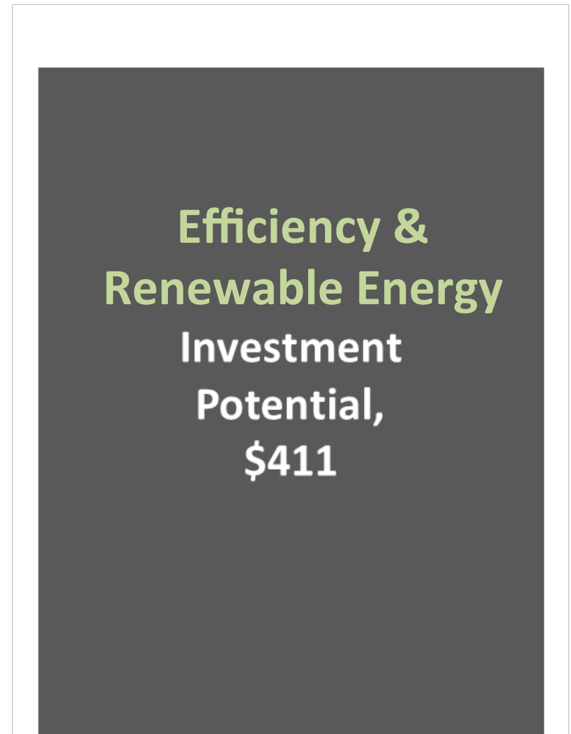
2014 Annual Potential (in $ millions)