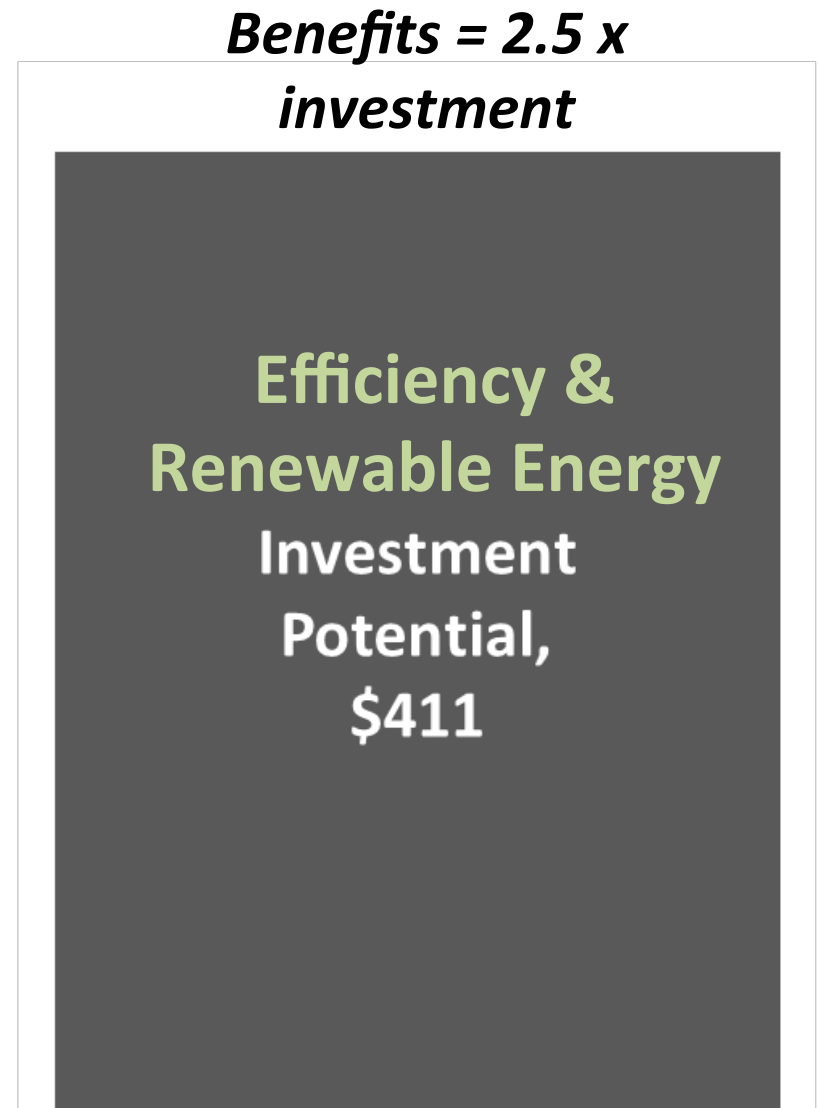
2014 Annual Potential (in $ millions)