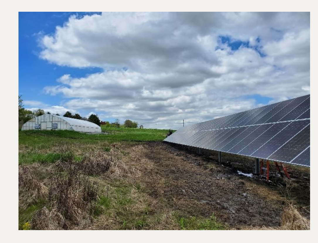
Parrfection Farm, Green County

7 covered areas: • Climate change • Clean energy and energy efficiency • Clean transit • Affordable and sustainable housing • Training and workforce development • Remediation and reduction of legacy pollution • Development of critical clean water and wastewater infrastructure